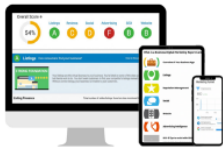
Marketing SnapShot Report

Profit Cents –offers clients access to the world’s leading business financial management system designed to help businesses improve profitability and cash flow, and to obtain financing.